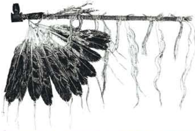
"Peace Pipe" Pen & Ink 26" x 30"

He is traveling back to a time when he used his hand to create the pictures, relishing each stroke, each gesture that brought the image—and his soul—to life.