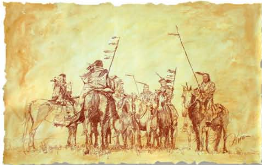
"Indian Council" Watercolor 30" x 40"