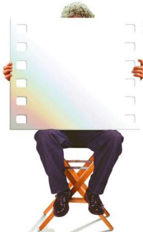
The man behind the movies.

The theme continues to be western, allowing him to return to a brief but indelible time in his life when